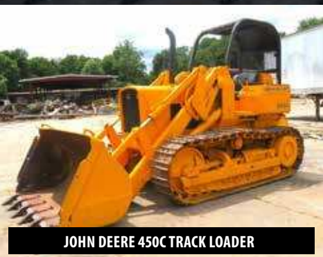
JOHN DEERE 450C TRACK LOADER