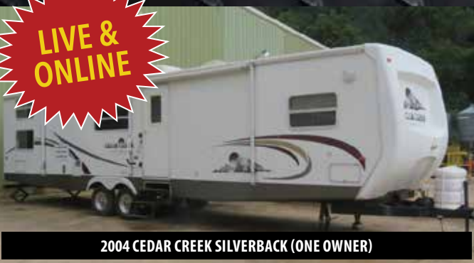
2004 CEDAR CREEK SILVERBACK (ONE OWNER)

ANCHOR STEAM POWER CO., INC. - ASHEVILLE, NC