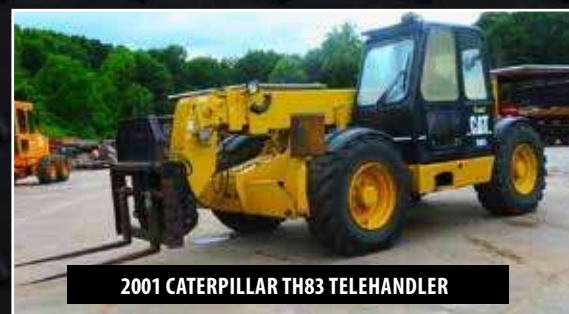
2001 CATERPILLAR TH83 TELEHANDLER