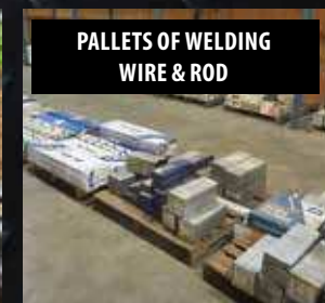
PALLETS OF WELDING WIRE & ROD

AUCTION LOCATION: On the premises of Anchor Steam Power Co., Inc., 80 Azalea Road E., Asheville, NC 28805