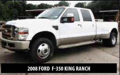
2008 FORD F-350 KING RANCH

AUCTION LOCATION: On the premises of Anchor Steam Power Co., Inc., 80 Azalea Road E., Asheville, NC 28805