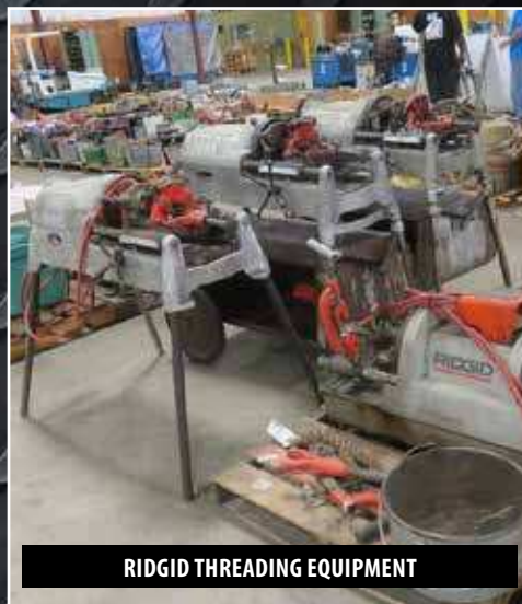
RIDGID THREADING EQUIPMENT