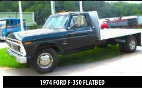
1974 FORD F-350 FLATBED

CAN'T MAKE IT TO THE AUCTION? BID ON PROXIBID, BIDSPOTTER OR EQUIPMENTFACTS