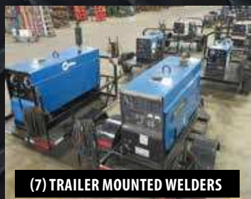
(7) TRAILER MOUNTED WELDERS