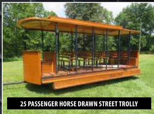
25 PASSENGER HORSE DRAWN STREET TROLLEY

SULLIVAN D185 QV Air Compressor, John Deere Diesel Engine, 2175 Hours, S/N 70214