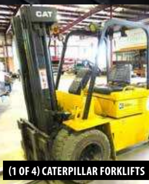
(1 OF 4) CATERPILLAR FORKLIFTS