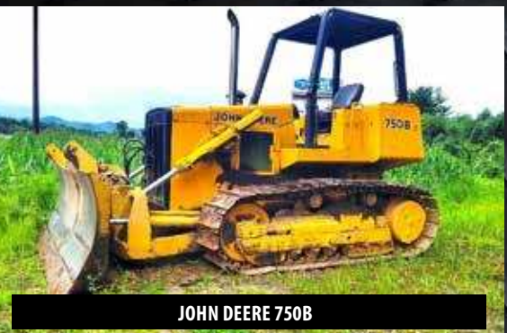
JOHN DEERE 750B