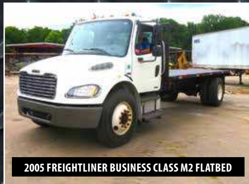
2005 FREIGHTLINER BUSINESS CLASS M2 FLATBED