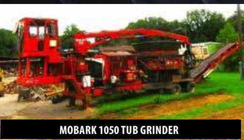
MOBARK 1050 TUB GRINDER