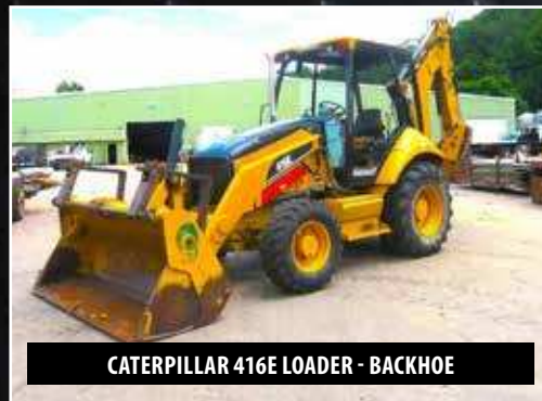
CATERPILLAR 416E LOADER - BACKHOE