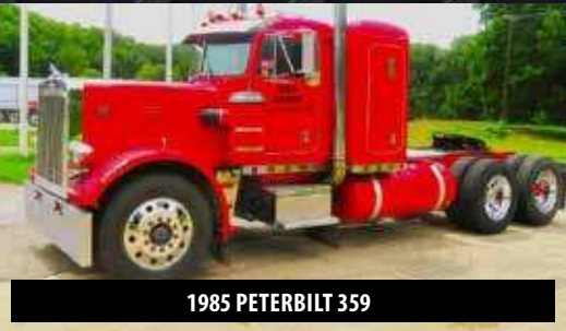
1985 PETERBILT 359