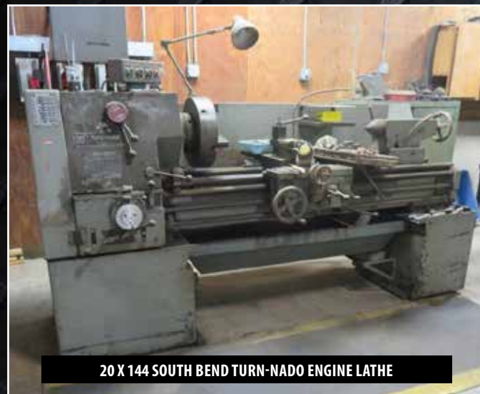
20 X 144 SOUTH BEND TURN-NADO ENGINE LATHE