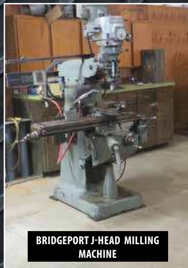
BRIDGEPORT J-HEAD MILLING MACHINE