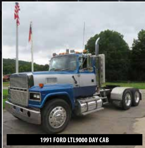
1991 FORD LTL9000 DAY CAB