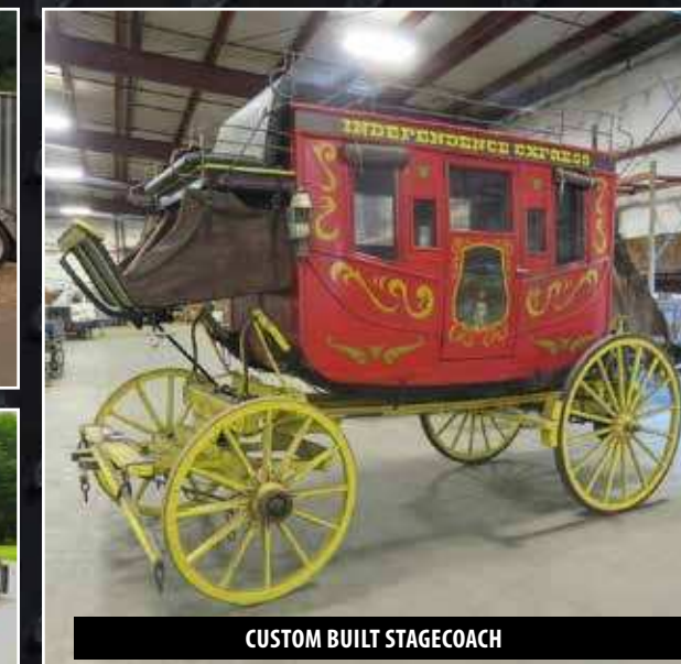
CUSTOM BUILT STAGECOACH