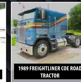
1989 FREIGHTLINER COE ROAD TRACTOR