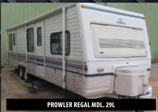
PROWLER REGAL MDL. 29L