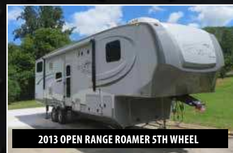
2013 OPEN RANGE ROAMER 5TH WHEEL

ANCHOR STEAM POWER CO., INC. - ASHEVILLE, NC