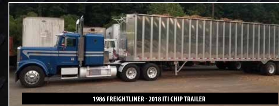
1986 FREIGHTLINER - 2018 ITI CHIP TRAILER

LOCATION: On the premises of Anchor Steam Power Co., Inc., 80 Azalea Road E., Asheville, NC 28805.