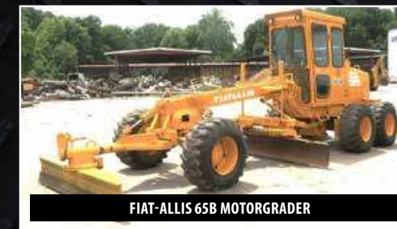
FIAT-ALLIS 65B MOTORGRADER