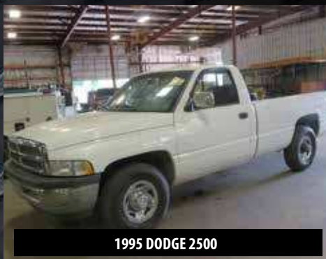
1995 DODGE 2500

ANCHOR STEAM POWER CO., INC. - ASHEVILLE, NC